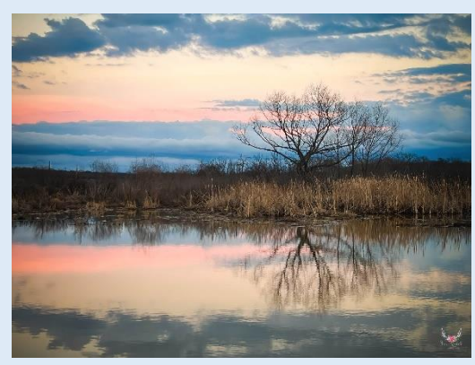
Sunset by Pam Rendall-Bass