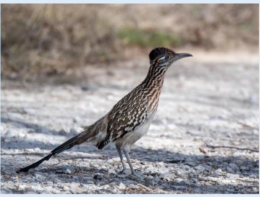
Greater Roadrunner