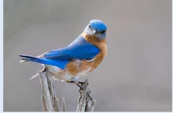
Eastern Bluebird by Mayve Strong