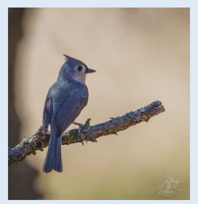
Titmouse