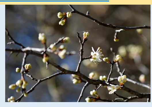
Mexican Plum