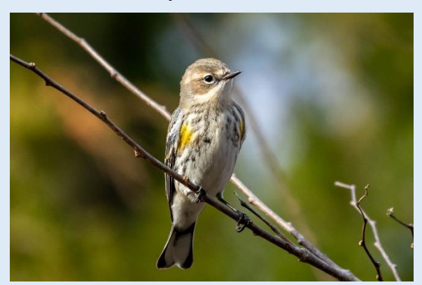
Yellow-rumped Warbler by Laurie Sheppard