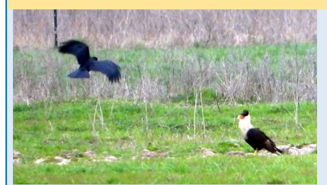
Crow chasing a Crested Caracara