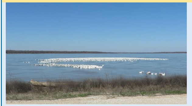
CLICK ON PHOTO TO OPEN VIDEO WITH SOUND Ross' Geese and Snow Geese