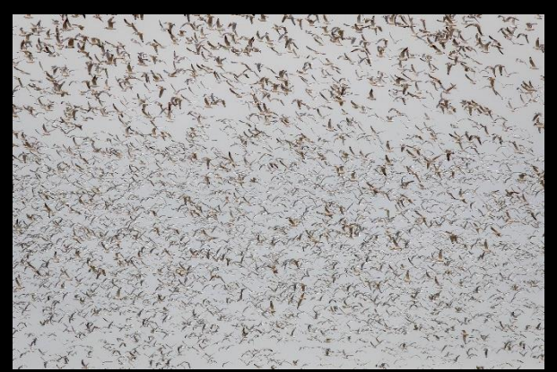
Thousands of Franklin Gulls