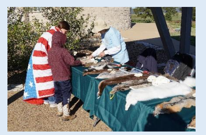
Skins and Skulls Displa