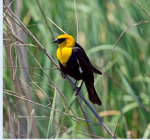
Yellow-Headed Blackbird