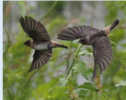
"Hey Mav ... Check your Six!" by Ken Rockwood

"It reminded me of a mix between a sculpture in light with the roaring twenties style combined"