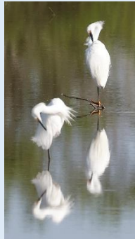
"Little Egrets Sculpture in Light" by Ken Rockwood

"I love the moment captured as it is just about to clear the lake's surface!"