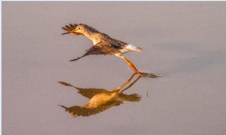
"We have Liftoff!" by Ken Rockwood

"I love the moment captured as it is just about to clear the lake's surface!"