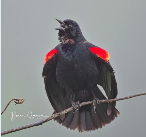
Red-winged Blackbird by Donnie Simmons