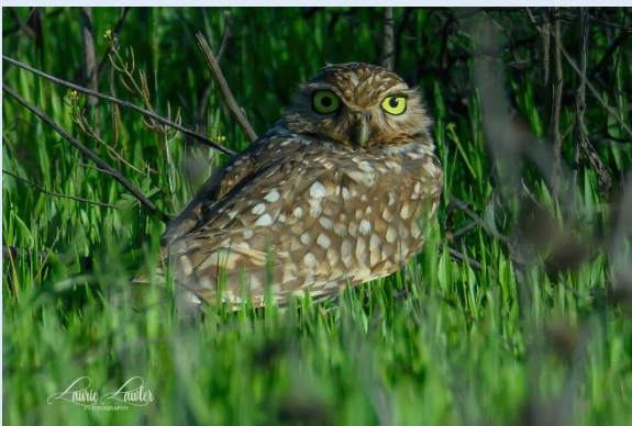
Burrowing Owl