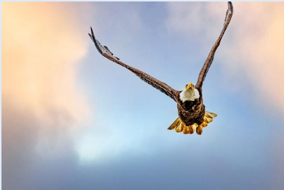
Eagle