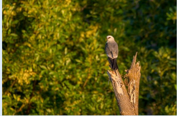
Mississippi Kite