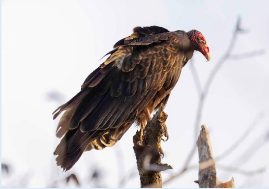
Turkey Vulture