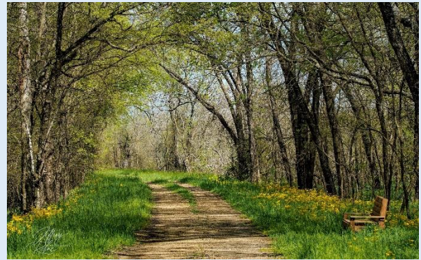
Meadow Pond Trail by Jeffrey Rolinc