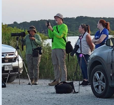
Using phone apps to plot where the moon will rise.