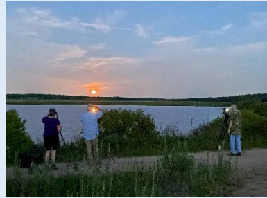
Camera has the moon in view on the camera's viewfinder.