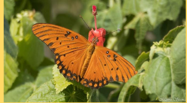
Gulf fritillary on Turk's cap by Mayve Strong