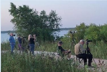
Set up and ready to shoot.

8/1/23 and 8/30/23 Night Photo Shoots. Photo club members met on 8/1 for a night photo shoot of the supermoon and also use light painting techniques. The event was so fun that members asked for another night shoot on 8/30 for the blue supermoon. On 8/1 we met at the end of Plover Road and on 8/30 we met at the end of Pad H for a different view. Please note that the refuge closes at sunset, but the photo club had permission to stay in the refuge after dark. Below are some of the photographers and their photos. For more photos go to the webpage for Photo Club Newsletters and Field Trips .