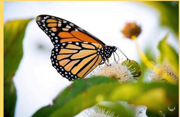
Monarch on Button Bush by Pam Rendall-Bass