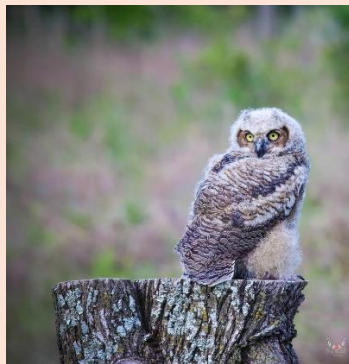
Great Horned Owl by Pam Rendall-Bass