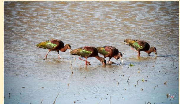
White-Faced Ibis by Pam Rendall-Bass