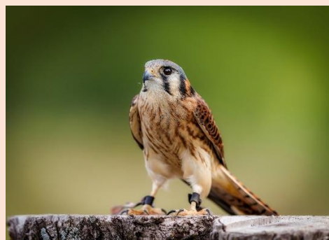
American Kestrel female