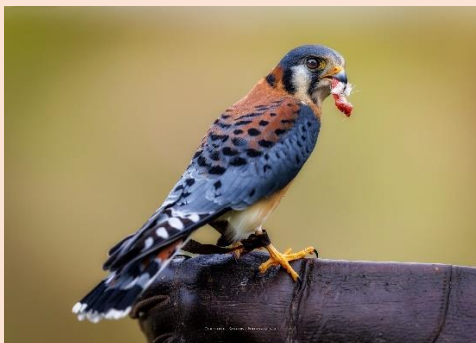
American Kestrel male