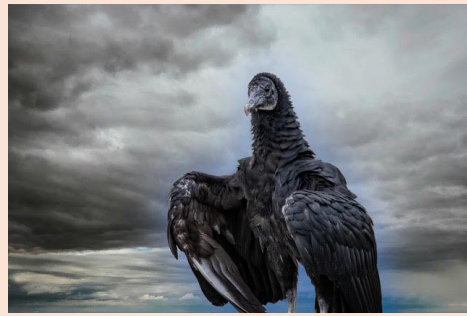
Black Vulture by Susan Supak