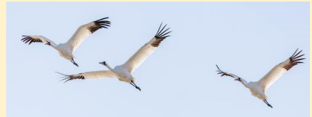
Whooping Cranes

Showcase Photos from Facebook Group: Friends of Hagerman NWR Nature Photography