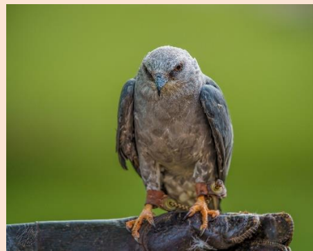
Mississippi Kite